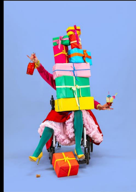
What A Carry On!